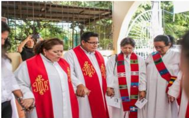
Iglesia Luterana de Fe y Esperanza de Nicaragua (ILFE)

Notable among the stories shared, was the ELCA's support for the Lutheran Church of Faith and Hope in Nicaragua. A ten-year sustainable agricultural project is in progress. Farmers have been able to increase crop production substantially, through the sharing of planning, working, marketing, and sales. This has enabled the community to sell at affordable market prices, which gives them justice. Church members offered their sincere gratefulness for assistance from ELCA Global Mission.